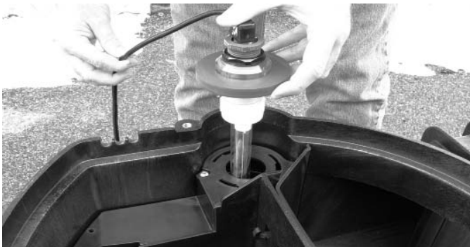
25 & 57-watt Retro-Fit UV Sterilizer

6.1 Quartz Sleeve Cleaning: To clean the quartz sleeve, unplug the unit and remove it from the filter. Using a soft, damp cloth, remove unwanted algae and dirt from the outside of the sleeve. Use vinegar or muratic acid to remove calcium deposits (Use extra caution when handling acids and strong cleaning solutions as they can cause bodily harm). A mild dish soap may also be used to clean the quartz sleeve. Make sure to thoroughly remove all cleaning solutions from the quartz sleeve before reinstalling the UV into the filter.