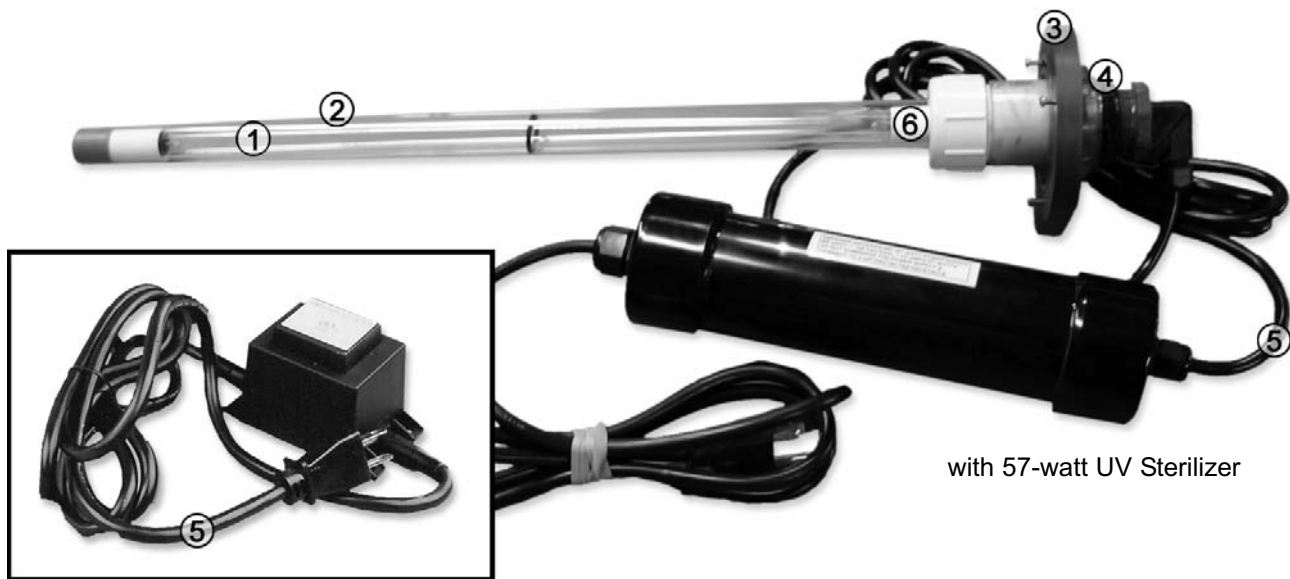
with 57-watt UV Sterilizer

*** Before Installing, Inspect for damage ***