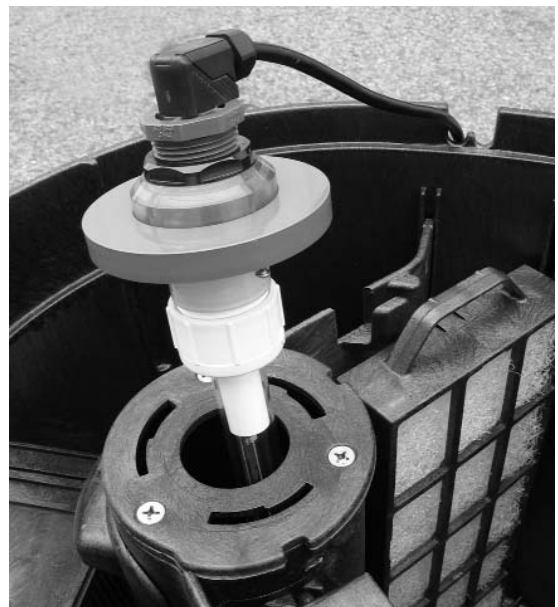
16-watt Retro-Fit UV Sterilizer