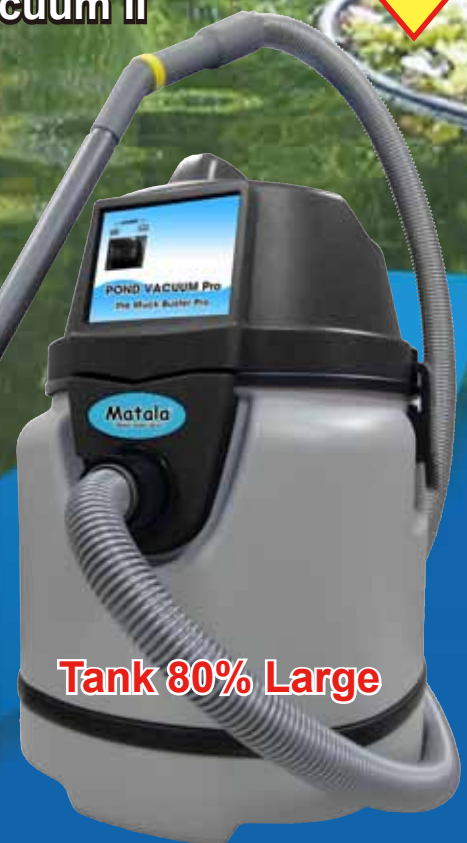
Tank 80% Large