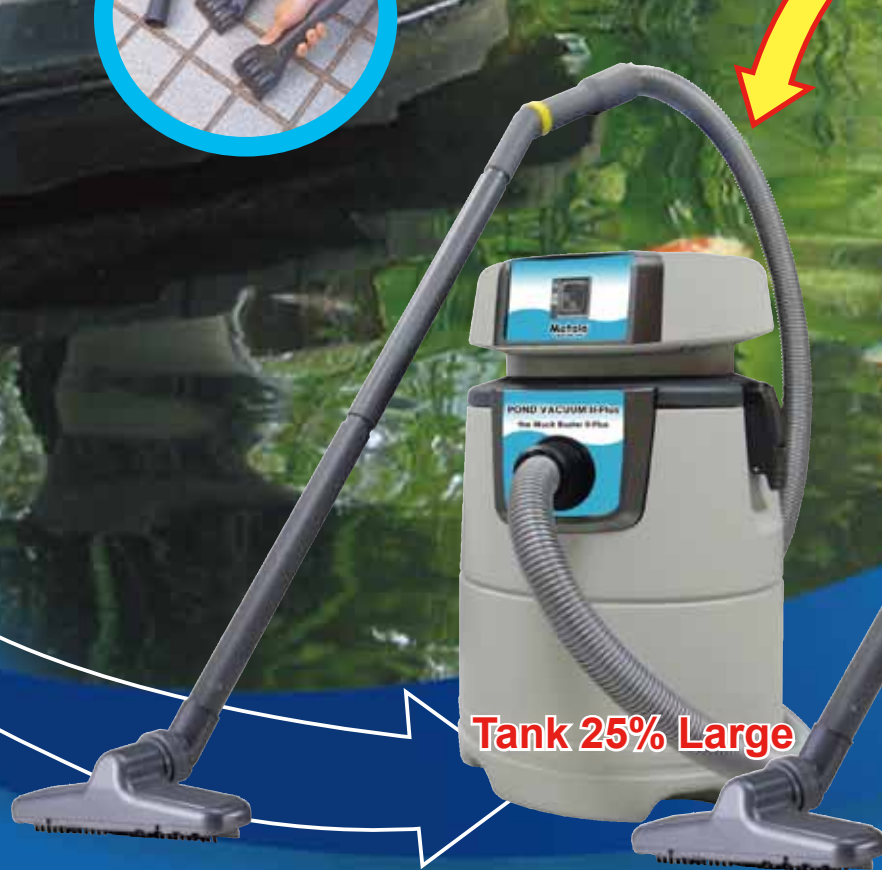
Tank 25% Large