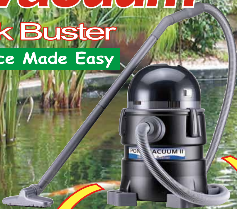
Pond Vacuum II