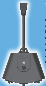
Smart Control Plug #82001

The easiest way to control existing water features, allowing you to control lights, pumps, or any other outdoor appliance at anytime from anywhere using the Smart Control App on your smartphone or tablet.